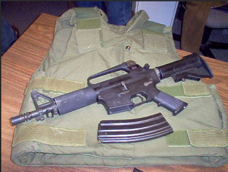
Assault rifle and body armour seized in drug raid