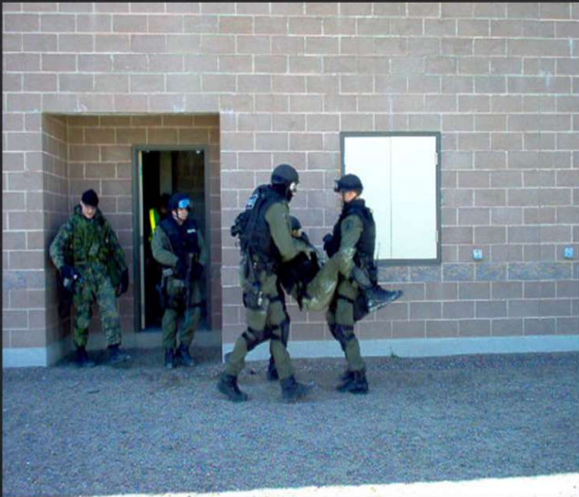
Injured Person Rescue