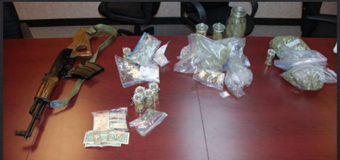
AK-47 rifle and more than $17,000 worth of seized drugs and property